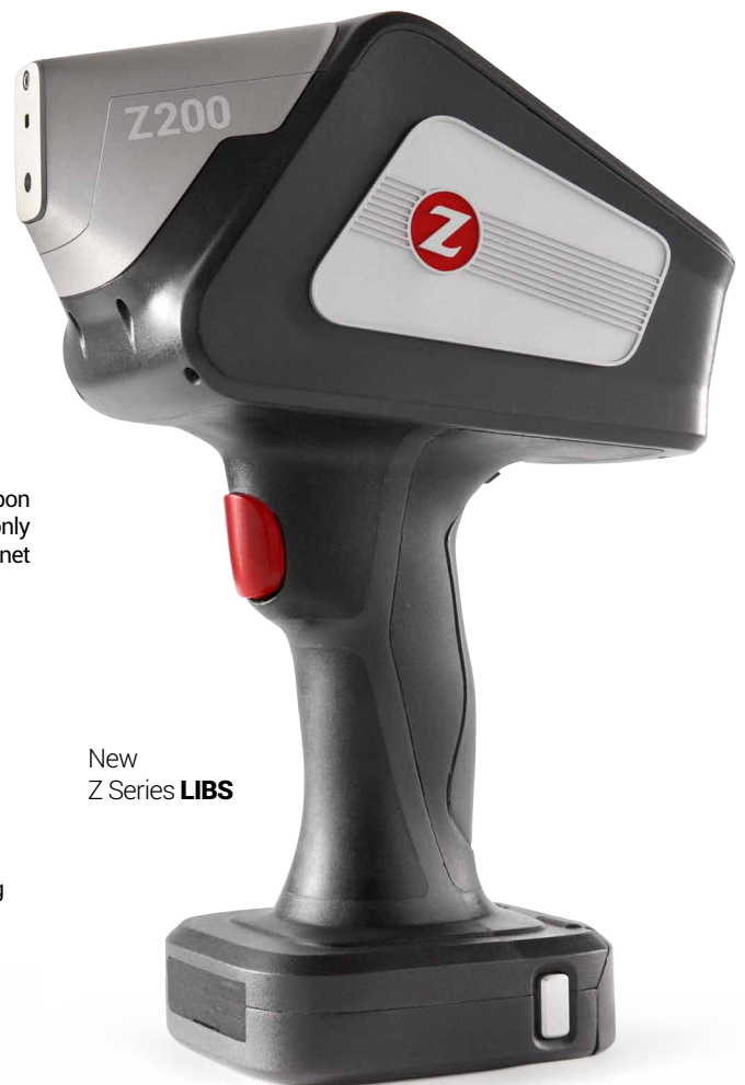
New Z Series LIBS

The "One-Box" - Analyze any element in the periodic table, any sample type, with optimal performance.