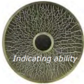
Pure magnetic powder