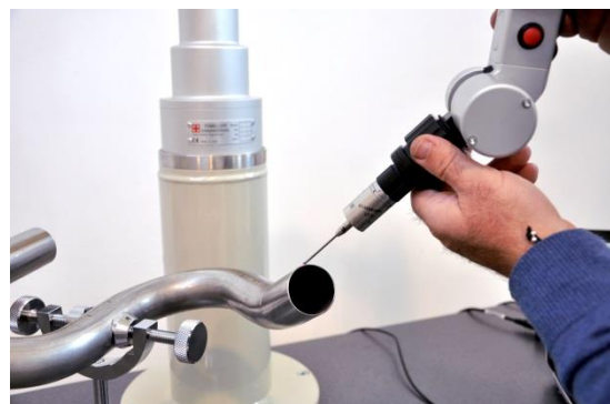
Pipe measurement by laser fork and touch probe (LP2 Renishaw™)