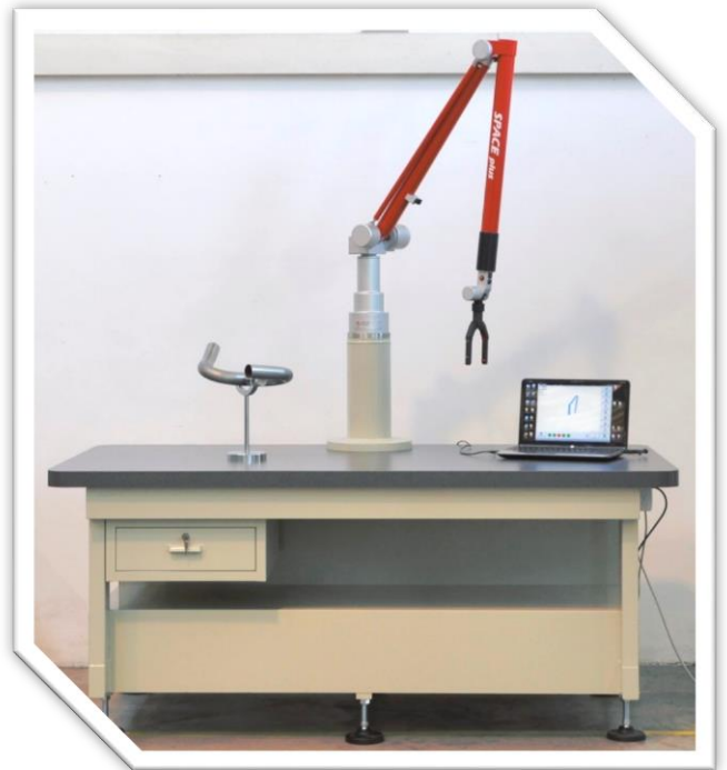
SPACE TUBO – (6 axes with laser fork) *=2 sigma error **with 50mm fork

Otherwise you can use the mobile tripod.