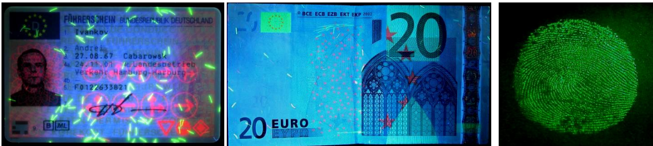
Identification of forged credit cards, banknotes and other materials

Never look into the UV light beam! Never look into the UV light beam with focussed optical equipment such as magnifying glasses, telescopes or microscopes. In this context, correction eyeglasses are not regarded as focussed optical equipment.