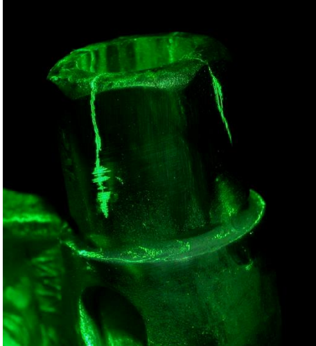
Fluorescent penetrant testing