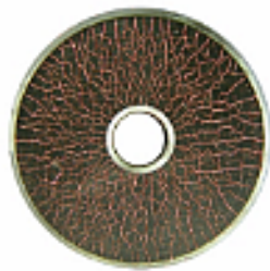
Anzeigebild picture of indications